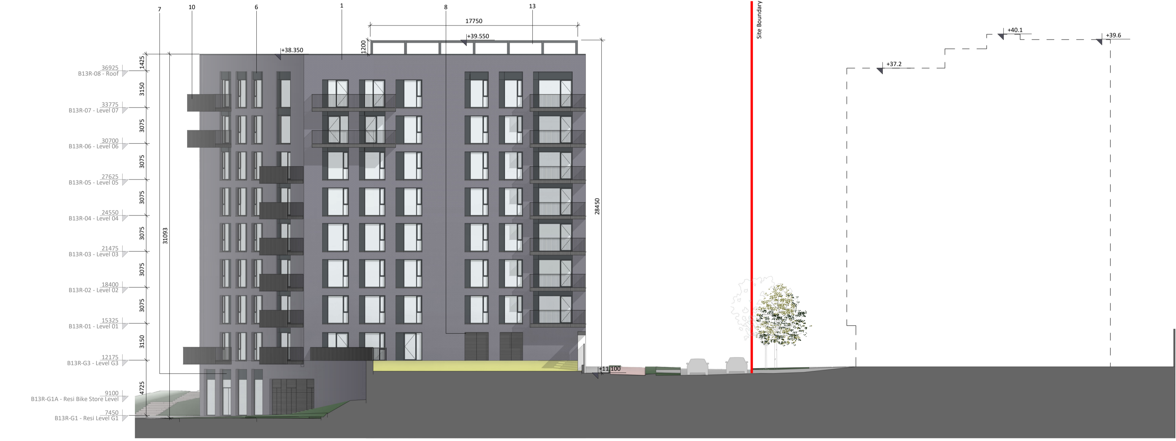
1 B13 Section B-B 1:200