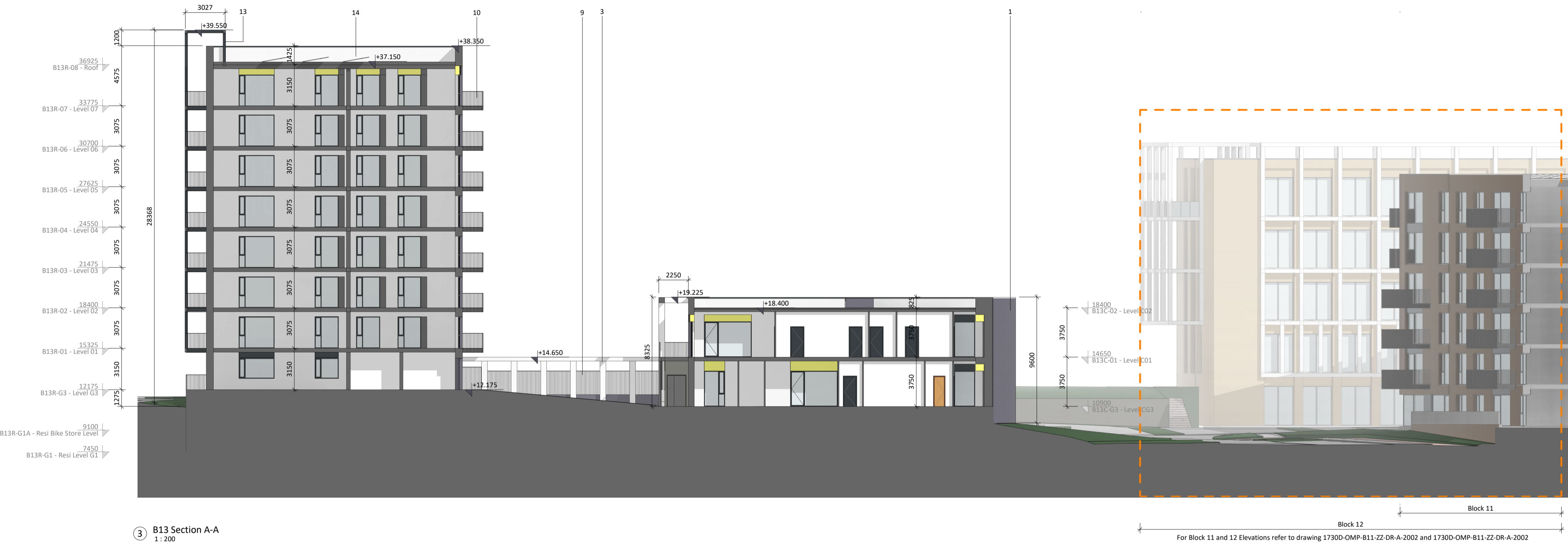
3 B13 Section A-A 1:200